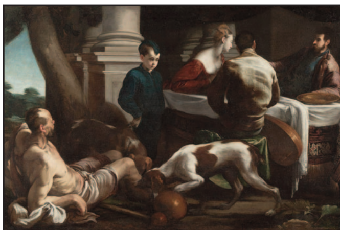
The parable of the rich man and Lazarus pictures how important it is to not value physical wealth about richness towards God.