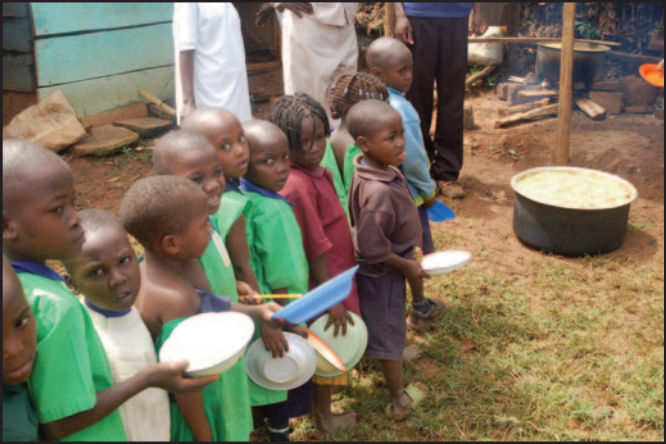
Many adults and children in Kenya are starving because of food shortages and one of the lowest per capita incomes in the world.

Those who are poor and in want did not become